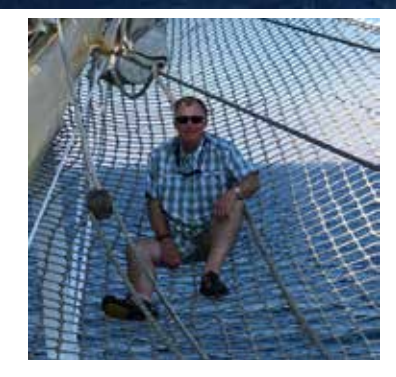
ROYAL CLIPPER CRUISE ATHENS TO ISTANBUL