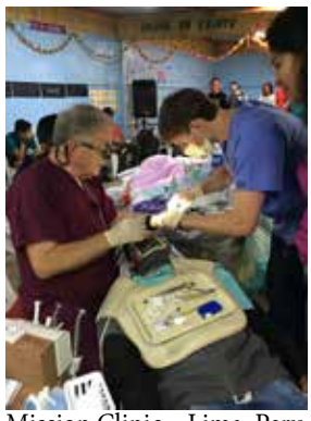
Mission Clinic - Lima, Peru