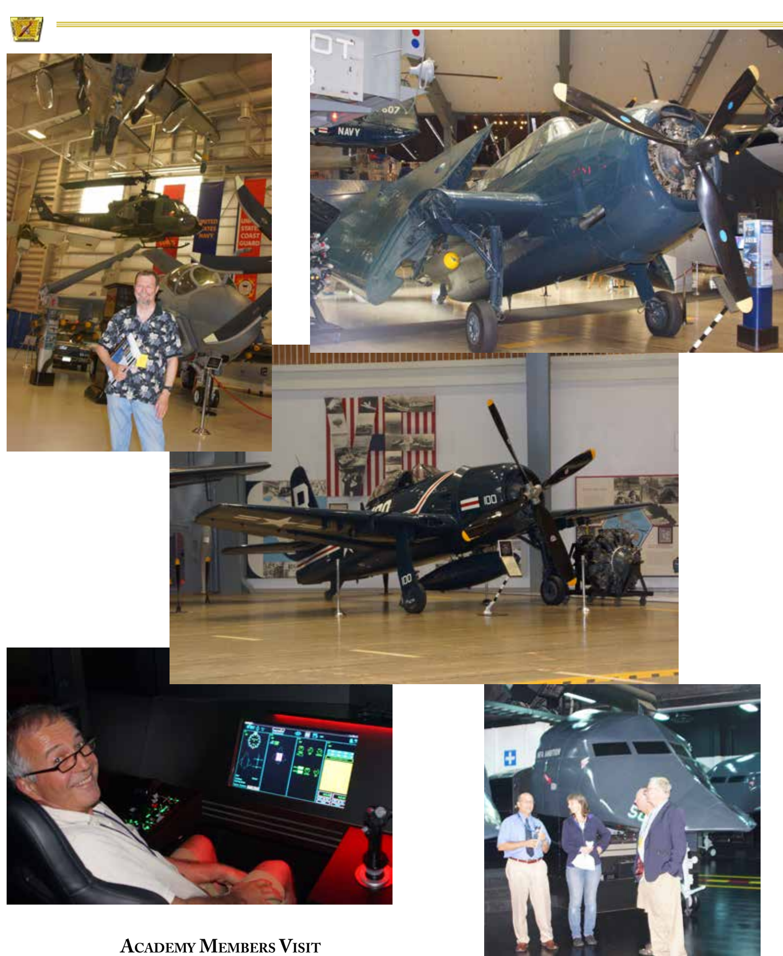
ACADEMY MEMBERS VISIT PENSACOLA NAVAL AIR STATION