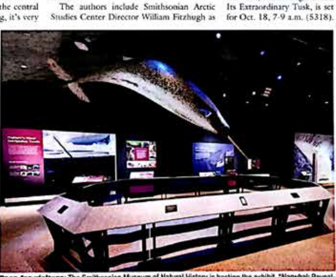
Open for visitors: The Smithsonian Museum of Natural History is hosting the exhibit, "Narwhal: Revealing an Arctic Legend," through 2019.

For more information on the exhibition, visit https://naturalhistoryxi.edu/exhibits/ narwhal/and for more on narwhals, go to narwhal.org. •